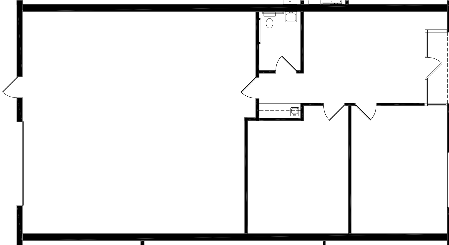
Unit 4 2,150 SF